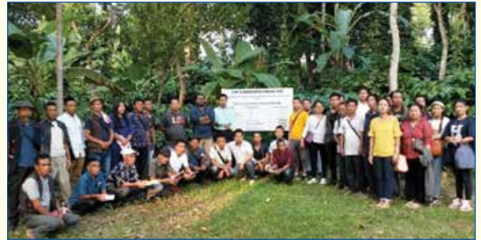
A view of tribal coffee growers from Nagaland and Meghalaya at RCRS, Diphu farm

Keeping in view of the above Regional Coffee Research Station, Diphu organized Capacity Building Programme for tribal coffee growers of Meghalaya and Nagaland during the month of September and October 2019 to educate the coffee growers on various activities on coffee cultivation, alerting them of arising problems and its precautions.