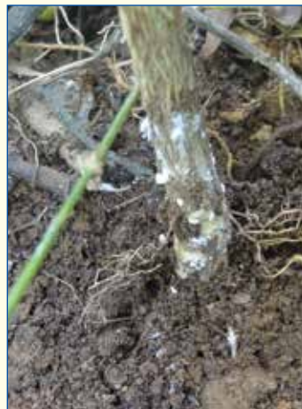
Root mealy bugs on young plants