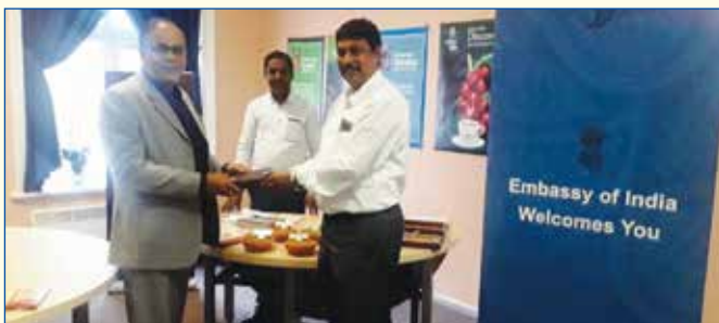
Exhibition of the Coffees of India - Finland

Separate exhibition cum business interaction space was provided to each one of the Indian exporters/ specialty coffee producers. The local