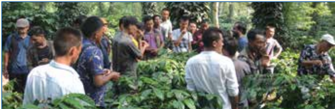
Demonstration of Bush management to coffee growers