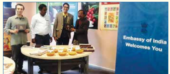
Exhibition of the Coffees of India - Estonia