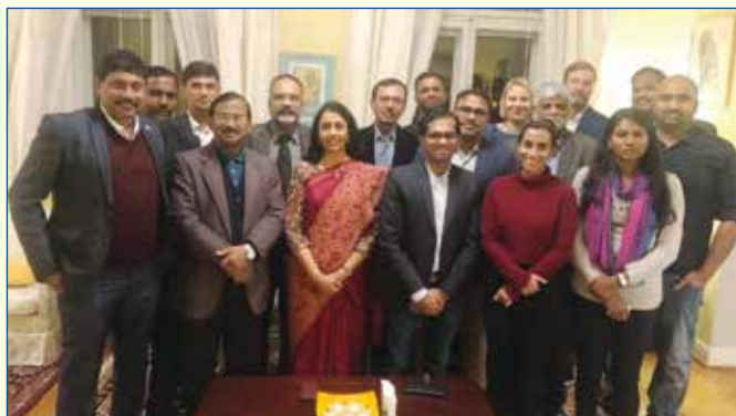
Indian Coffee Trade Delegation visit to Hesinki (Finland) from 14th – 15th October – 2019

The market potential for Indian Coffee in Estonia is massive, here trade establishments are offering more Specialty Coffees and exotic flavors, based on the Estonians' tastes in coffee are becoming increasingly sophisticated. Estonians are expecting more premium organic coffee brands on the shelves of supermarkets, as these are often well positioned in the organic sections of the largest retail chains.