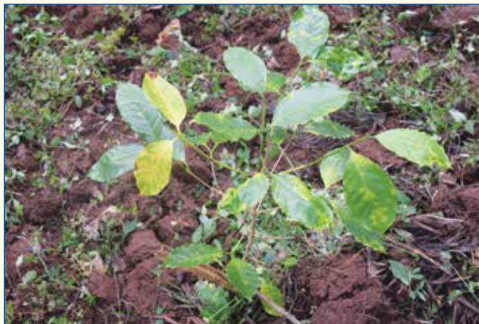
Root mealy bugs infested plants showing yellowing

main root and suck the sap resulting in drying of such roots; general weakening of the plants, yellowing and narrowing of leaves and death of young plants. Mealy bugs on the root are often protected in a fungal envelope ( Diacanthodes sp. ) which hinders the absorption of nutrients.