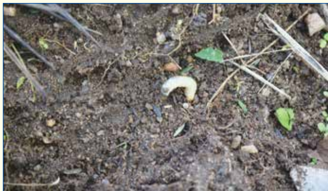
Cockchafer grub feeding on coffee roots

Mealy bugs infest tender branches, nodes, leaves, spikes, berries and roots in large numbers. Young plants succumb to heavy infestation. Leaves become chlorotic, flower buds abort, berries become small and weakening or death of plant if severely infested. If the roots are infested, such plants look wilting and with yellow leaves as it is suffering from moisture stress. Careful examination of infested plant roots will reveal white, cotton-like masses. Infested plants are found associated with ant colonies near the stem region at soil surface by which mealybug infestation could be easily recognized. They are colonized in junction of the lateral and the