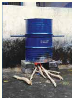
Biocharing of Coffee White Stem Borer Infested Stem under Oxygen-Limited Condition

Coffee processing at curing factory results in the generation of by-products such as cherry husk and parchment peels. Every tonne of