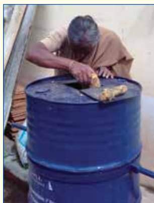
Loading of cut pieces of Coffee White Stem Borer Infested Stem