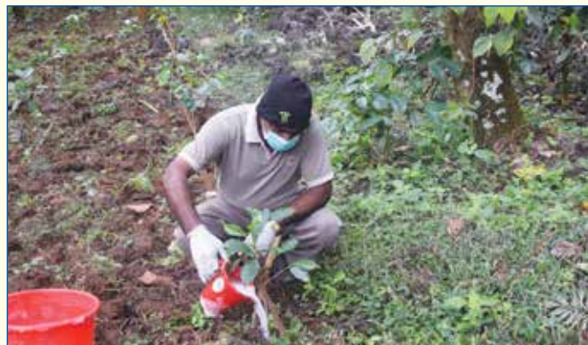
Drenching insecticides for root mealy bugs