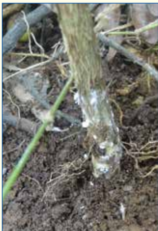
Root mealy bugs feeding roots of young coffee plants