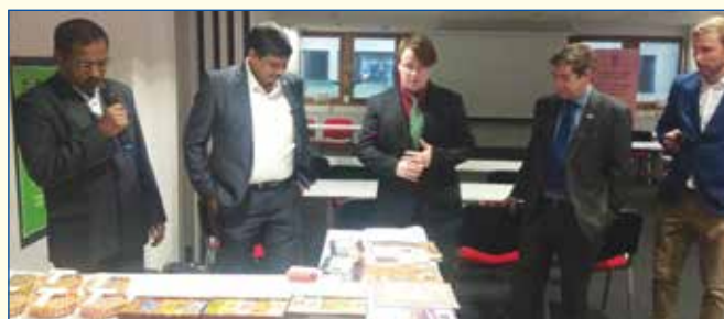
Exhibition of the Coffee of India - Finland