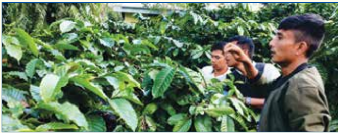
Coffee growers performing bush management