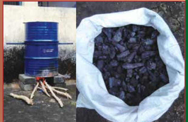
P-04 Preparation of Biochar from Coffee Stems