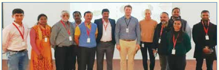
Visit of Paulig Coffee Roastery - Finland