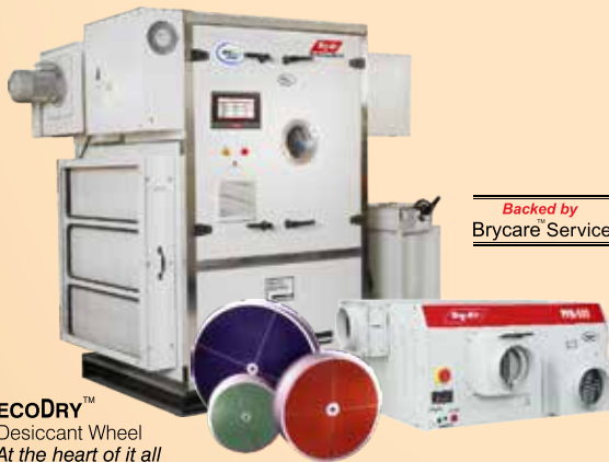
ECO DRY™ Desiccant Wheel At the heart of it all

You need dry air to prevent lumping of coffee powder and ensure free flow during processing, conveying and packaging