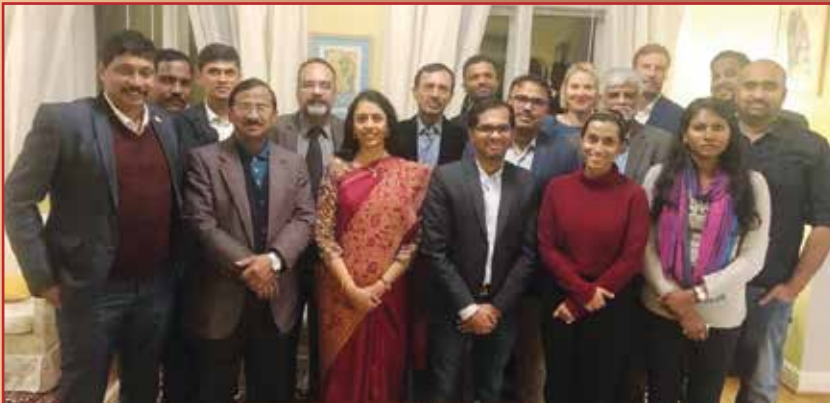
P-17 Indian Coffee Trade Delegation Visit to Finland and Estonia