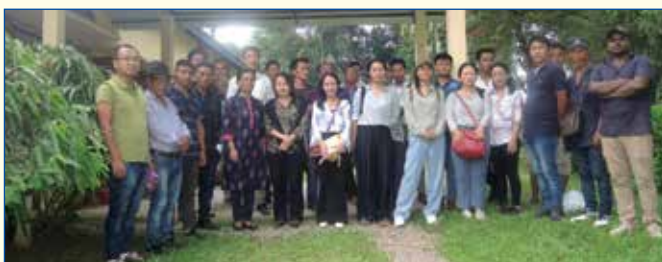
A view of participants from Department of Land Resources, Nagaland