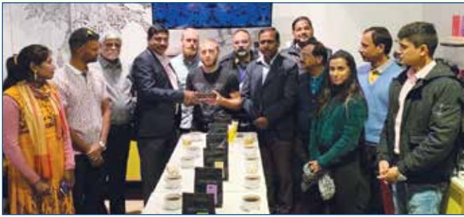
Visit of Kaffa Roastery - Finland