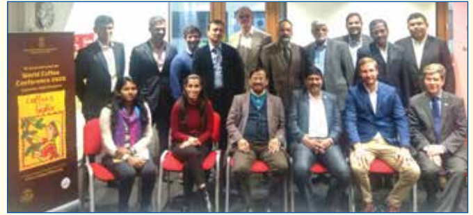
Buyers Sellers meet - Finland

that makes traditional coffee roasters. Trade delegates accompanied us have offered their coffee samples to the roasters in view of their business development.