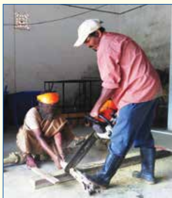
Cutting of Coffee White Stem Borer Infested Stem

Conversion of plant biomass such as wood to biochar stores carbon that otherwise would have been emitted as Carbon-Dioxide (CO 2 ) when the biomass is decomposed. Thus, production of biochar from plant residues/by-products is considered as Green Technology, as it reduces emission of Green House Gases (GHCs).