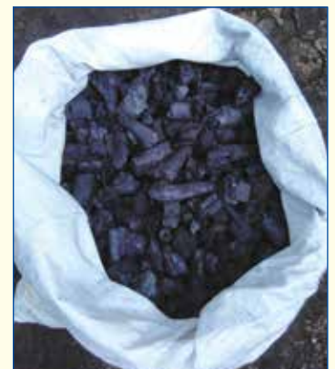
Biochar from Coffee White Stem Borer Infested Stem