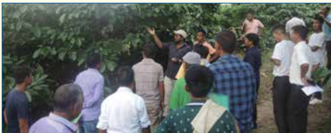
Coffee growers from Nagaland performing farm cultural operations at RCRS field

measures, method of fertilizer and compost application, borer tracing, lime application against white stem borer and different methods of composting.